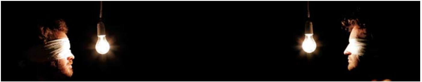
d&k 2010 (detail)