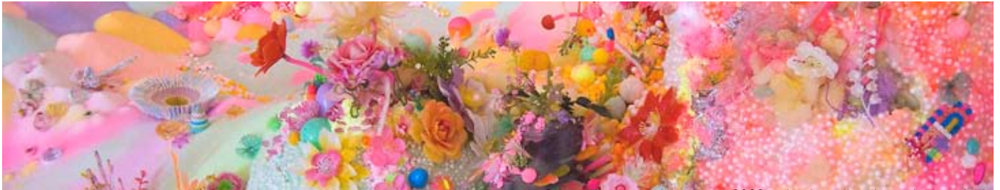
pip & pop, 3 minutes happiness, 2009, mixed media, dimensions variable

28 May–26 June duo openings at duo venues Thursday 27 May AEAF gallery: 5.30-7pm Queen's Theatre: 7.00-8.30pm performance, installation, screenings, talks page 1 of 4