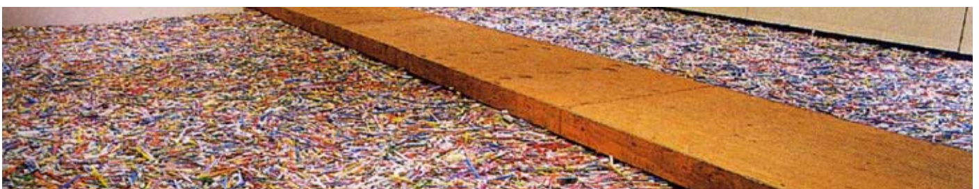
Alfredo and Isabel Aquilizan, Presences and Absences , 1999, Asian Art Museum, Fukuoka Japan, used toothbrushes, wooden pathway

Do join us as we continue this insightful program into all kinds of ephemeral processes and practices and the crucial role they play in everyday life.